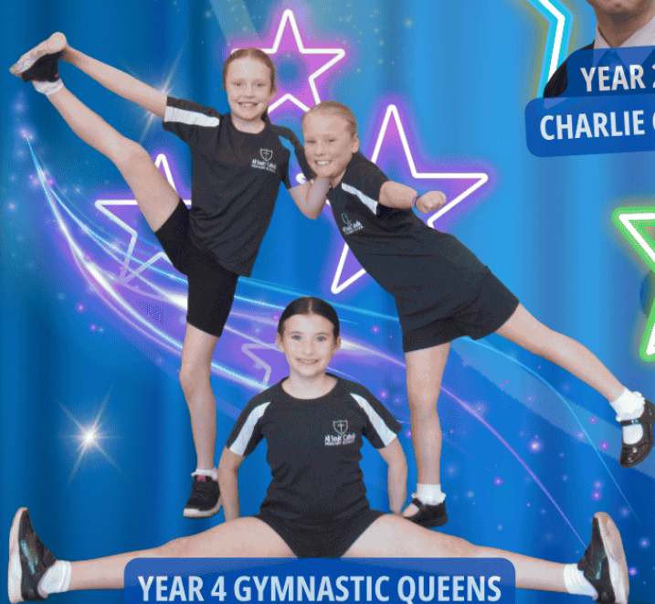
YEAR 4 GYMNASTIC QUEENS