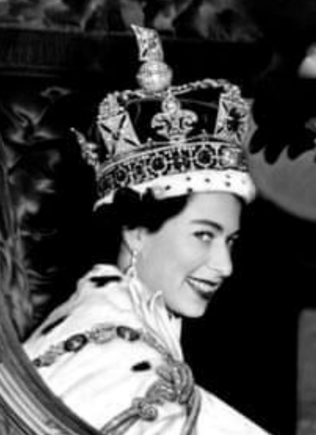
Photo taken aged 27, a young Queen.