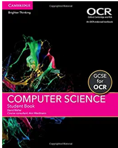
GCSE Computer Science for OCR Student Book