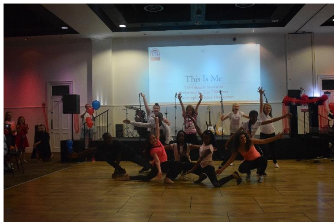
This is Me – dance performance

On Thursday 19 th July, we celebrated our final awards ceremony of the year at the Holte Suite Villa Park. Over 150 pupils and their families attended the evening celebrating the success and achievements of our students. Throughout the evening, various awards were handed out such as Outstanding Achievement , Head teachers' award for Academic Progress , Music and Drama Awards and awards for meeting the Wiseman Virtues . The evening included a variety of dance, drama and music performances and the announcement of our new Student Leadership Team. The evening ended with the students enjoying themselves on the dance floor with a disco. Thank you for all the parents and students who attending the evening; it was a pleasure seeing so many families celebrating the success of all our pupils at Cardinal Wiseman. Well done to all our students who received an award.