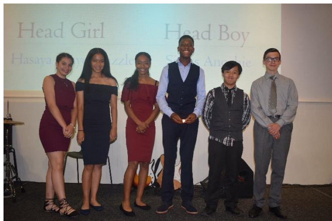
Newly appointed Student Leadership Team