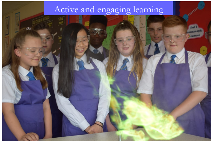
Active and engaging learning