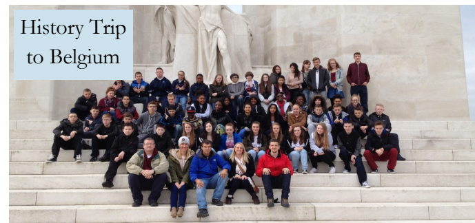
History Trip to Belgium

“Absolutely fab school, would recommend. My daughter is taught well. Very friendly and welcoming. Thank you for the hard work in teaching my daughter”.