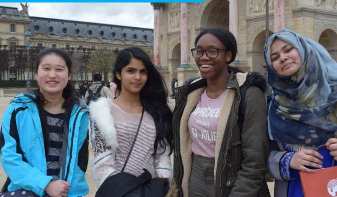
Art Trip to Paris—April 2018

CARDINAL WISEMAN CATHOLIC SCHOOL Old Oscott Hill, Kingstanding, Birmingham, B44 9SR Phone: 0121-360-6383 E-mail: enquiry@cardinalwiseman.net www.cardinalwiseman.net