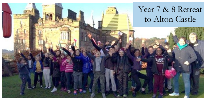
Year 7 & 8 Retreat to Alton Castle

The headteacher provides strong and effective leadership. She has driven forward improvements in teaching and has shown great determination in improving all aspects of the education that the school provides. Ofsted Sept 2016