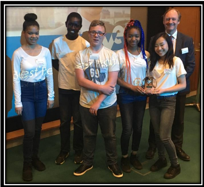
Best Company Presentation