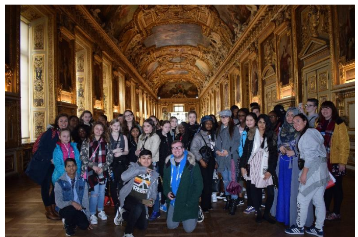
Inside the Louvre