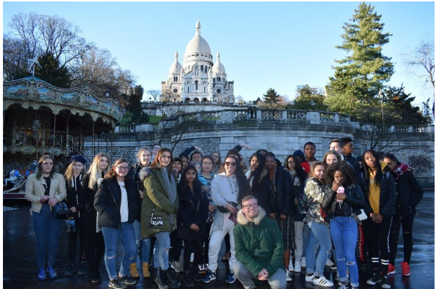
Sacre Coeur - Montmartre

Pupils from Years 9-11 had a fantastic Art trip to Paris at the end of last term. After the coach journey through the Eurotunnel, pupils settled down for the night in a hotel just north from the city centre. The day in Paris started with a continental breakfast to fill the pupils and staff up. We then visited the Louvre and saw some of the world's most famous paintings including the Mona Lisa, which surprised many pupils as it was much smaller than they thought it would be.