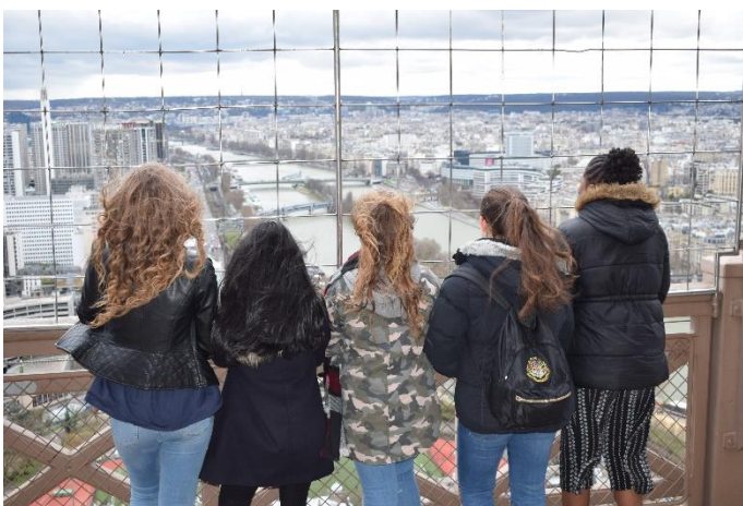
View from the Eiffel Tower