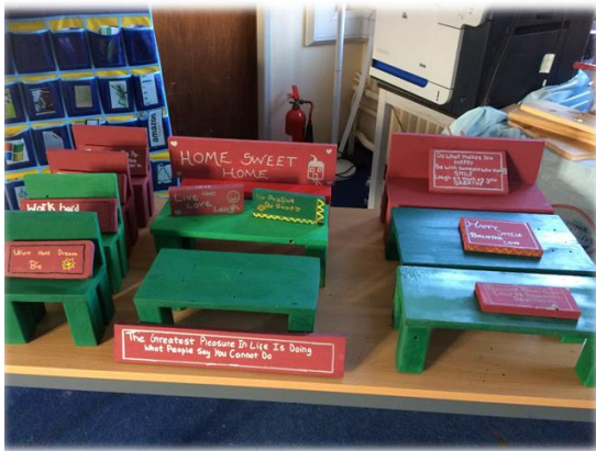
Easter Presents - Available from Room 10