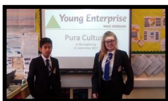
Bowls of Delight

Easter Sale: Last day of term Thursday 29 th March Break time Students and staff