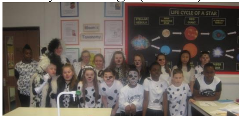
Best dressed tutor group: 7 Newman

We also donated a staggering £315 for Book Aid International! Thanks to our donations, the charity has sent over 55,000 books to Africa! Thank you for your generosity and well done to all involved – we can't wait for next year already!