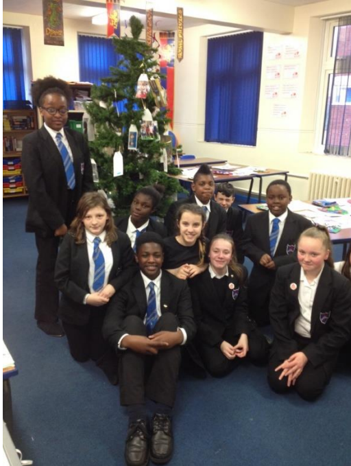
Year 7 Genealogy and Heraldry students share their work on their own family trees.

A large number of pupils in Years 7 and 8 exhibited the work that they have been doing in their challenge subjects. Students who study Dance or Music performed their work in the show where students who study Sport, Genealogy and Heraldry, Debating and App Creator had to create an exhibition which was presented to their parents. A large number of parents attended the event and were well and truly impressed with the work that their child has been doing.