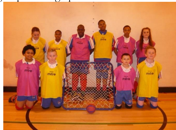
Year 8 Tchouckball Team

Well done to the students and staff involved and thank you to the parents and carers who came along to support their child at this event. I am so proud of you!