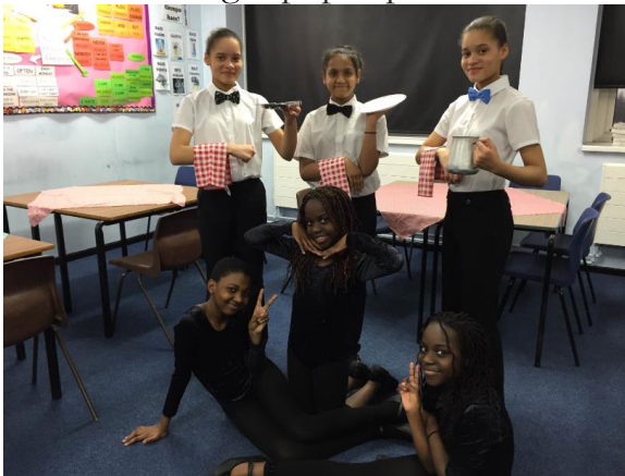
The year 7 and 8 Challenge French groups serving up a real treat.

Creative Writing – pupils presented their creative writing projects, on a topic of their choice.