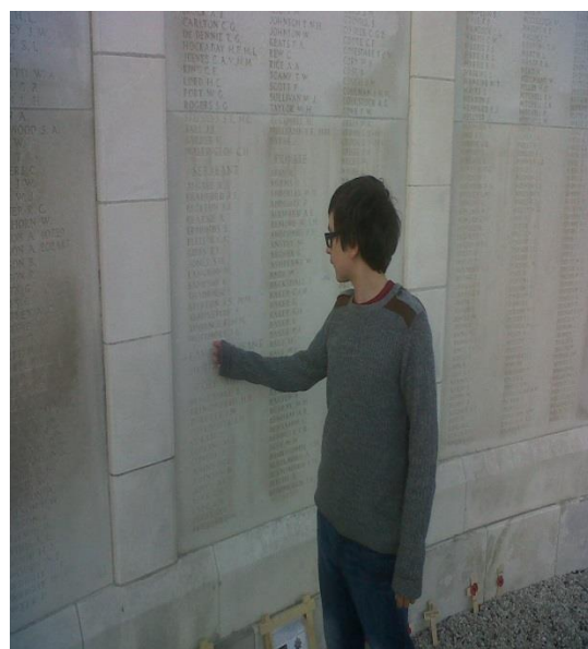
British military cemetery at Tyne Cot