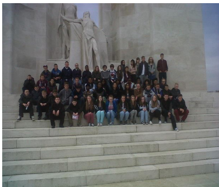
Canadian memorial at Vimy Ridge

We then travelled across the border to Belgium to visit several different battlefields and their accompanying memorials and cemeteries. The spectacular monuments at Vimy Ridge and Thiepval brought home the sheer scale and cost in human life. The beautifully maintained cemeteries provided pupils with an opportunity to survey the sights of the battles themselves – especially that of the Somme.