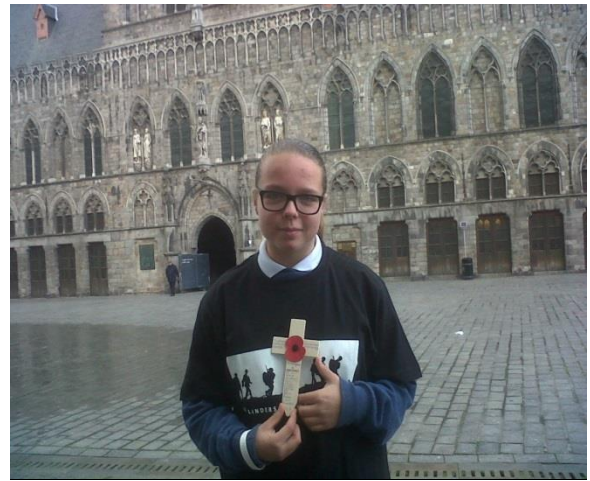
Outside the Cloth Hall in Ypres

The Cloth Hall in Ypres contained an astonishingly detailed exhibition entitled 'In Flanders Fields', after the famous poem written by John McCrae in 1915. The astonishing numbers of artefacts were accompanied by video footage and the stories of individuals from both sides of the conflict. Following a day in and around Ypres we joined the crowds at the famous Menin Gate for the sounding of the Last Post at 8pm. A ceremony which has taken place every night since the 1920s!