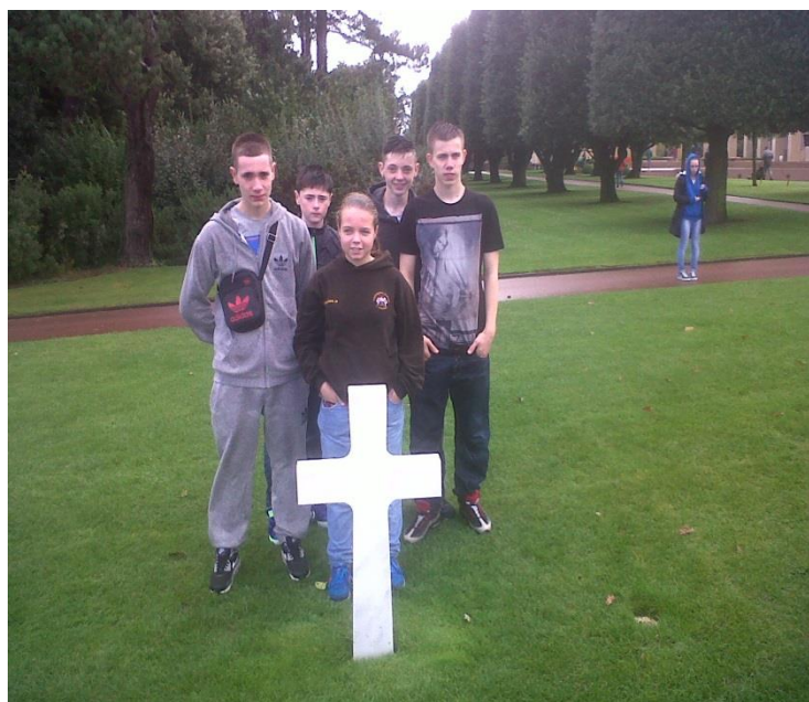
The American military cemetery at Colleville

Fifty five pupils from Years 10 and 11 and five members of staff spent the last week of half-term in France and Belgium, visiting the sights of the D-Day Landings and Great War battlefields. The first sights to be seen were the beaches code named Juno and Omaha, along with the small coastal town of Arromanches which contains the remains of a temporary harbour created to allow the Allies to land troops and equipment following D-Day.