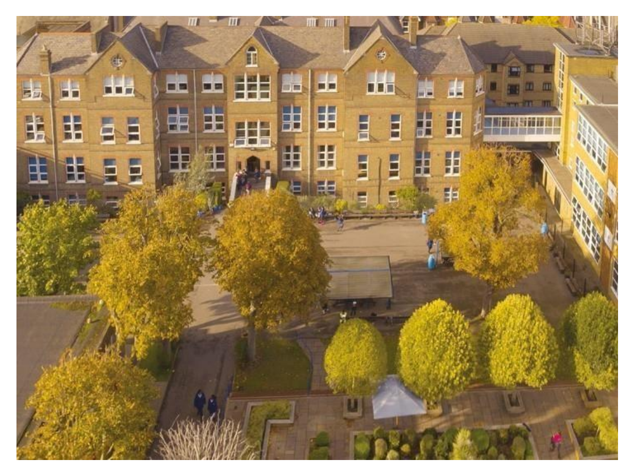
"With God's grace, we excel and lead"