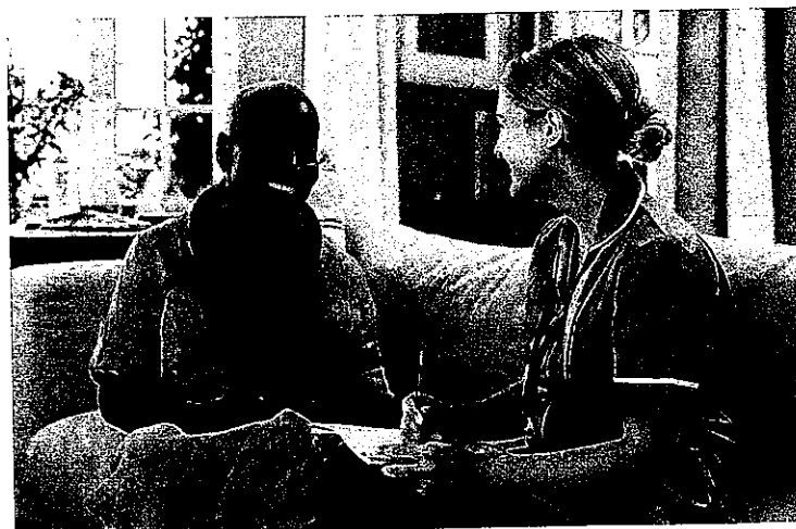
■ Care worker visiting a client in their home

Older adults who have conditions that make them more dependent on care and support may benefit from residential care. For example, an individual who struggles with personal care and mobility will have the support of trained staff to help with washing and dressing. Specialist equipment is available to help individuals to move comfortably and safely. If an older adult gets confused easily or has poor memory, medication can be managed and administered by health professionals at the care home. Social activities and the company of others at a care home can benefit older adults who might otherwise be socially isolated at home.