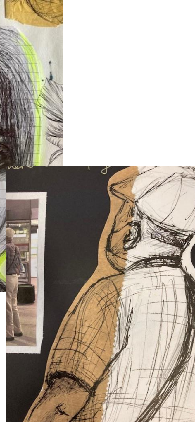
Student used biro pen for each study, but changes the way they use the pen marks. Using different background papers can also change the look of the piece