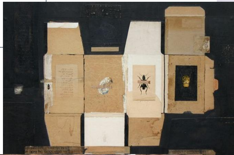
Year 10 Acrylic painting onto plastic

Your choice of experiment linking to the Environment theme onto a found surface