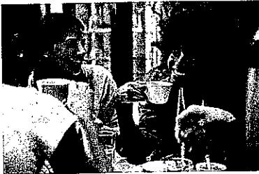
■ New relationships are part of our emotional and social development

Relationships are really important for our emotional and social development. People form new relationships at every life stage. In early childhood, children tend to make friends with those they see regularly and who have the same interests. From adolescence, people begin to widen their social circles. They tend to form close friendships and intimate relationships with others who have similar values and interests.