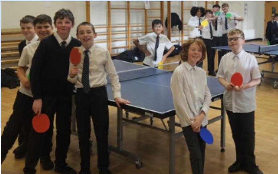
Table Tennis Club

Year 10 Parents' Evening, 2.45pm-6.00pm (online)