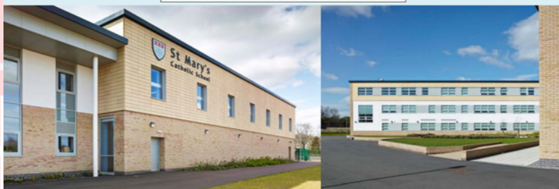
ST MARY'S CATHOLIC SCHOOL