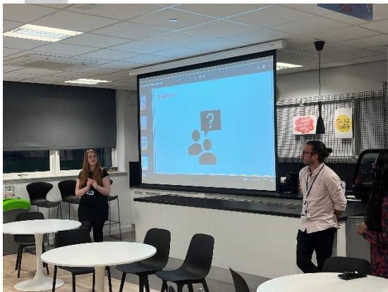
National Audit Office