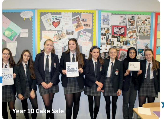
Year 10 Cake Sale