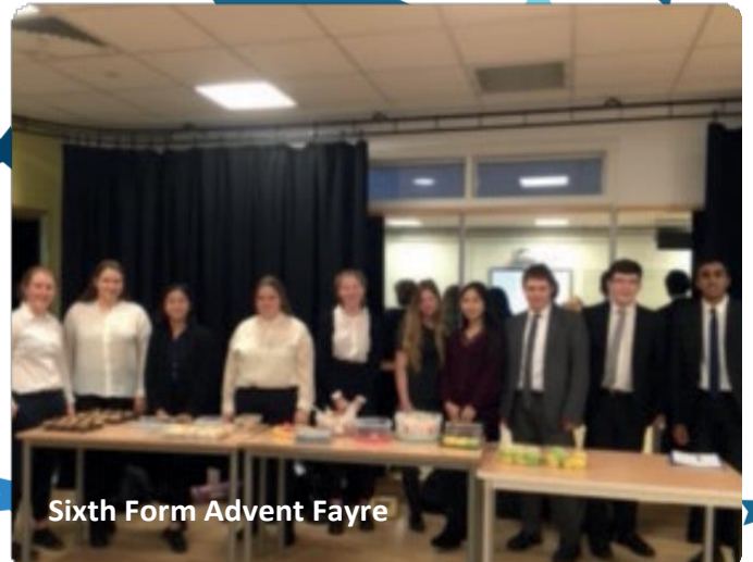
Sixth Form Advent Fayre