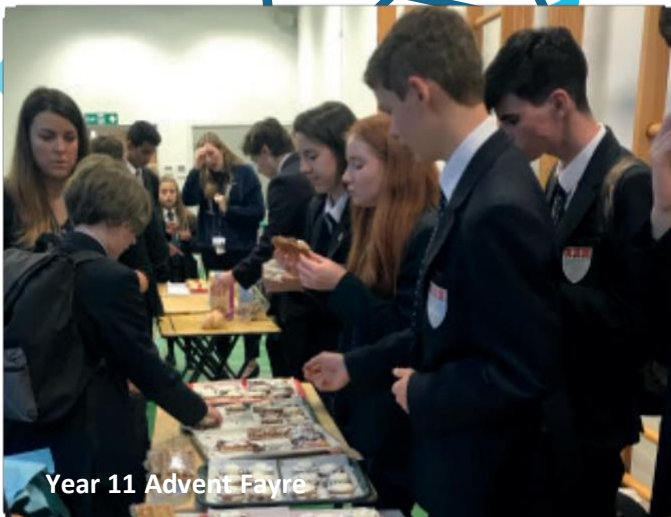
Year 11 Advent Fayre