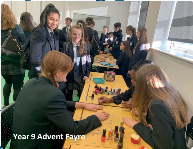
Year 9 Advent Fayre