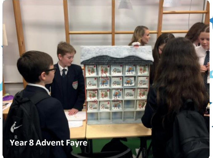
Year 8 Advent Fayre