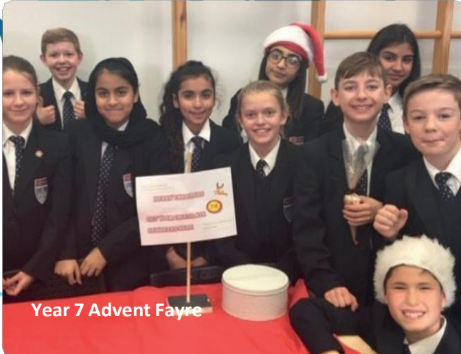
Year 7 Advent Fayre