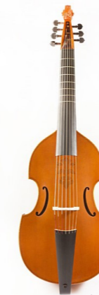
A Bass Viol

The right hand of the harpsichord plays a " realisation " (which would have been improvised at the time), which fills out the chords of the piece.