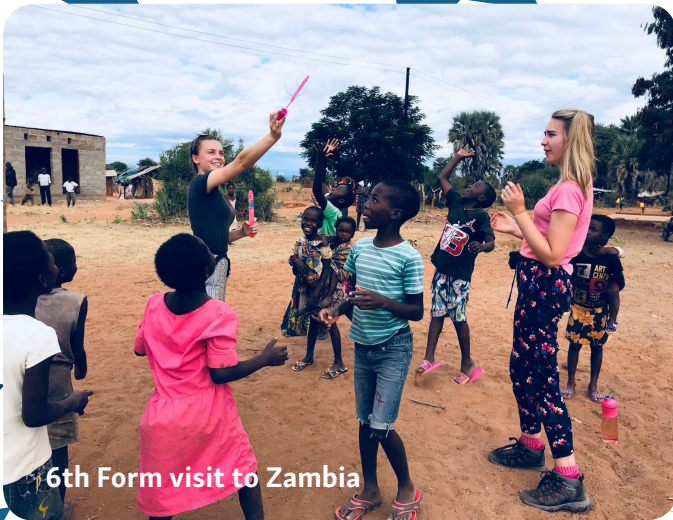
6th Form visit to Zambia