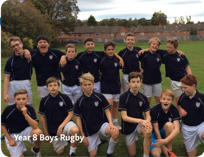
Year 8 Boys Rugby