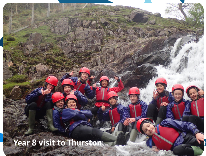
Year 8 visit to Thurston