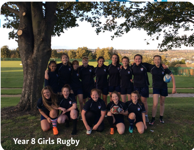
Year 8 Girls Rugby