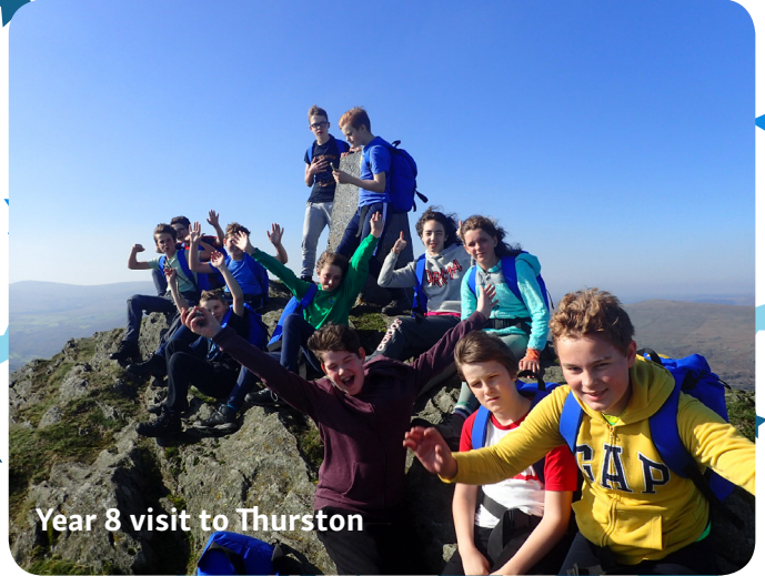
Year 8 visit to Thurston