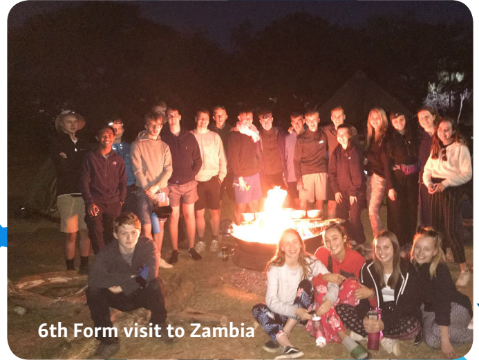
6th Form visit to Zambia