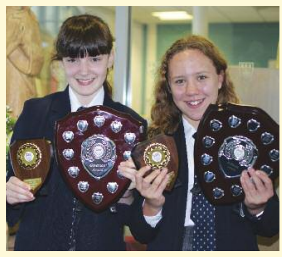
A small number of this year's prize-winners with their awards