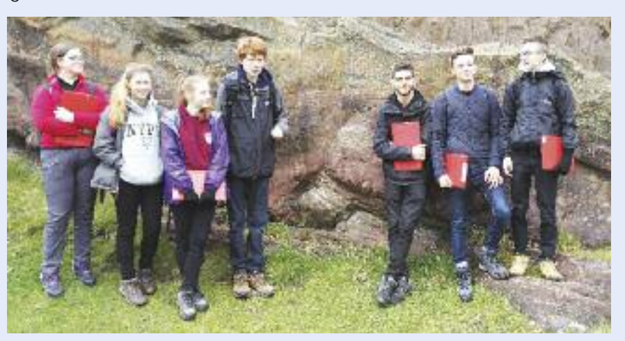
The geographers photographed in front of Hutton's Section