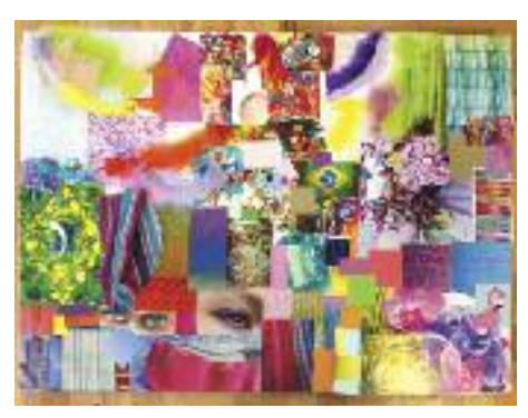
A mood-board created to represent the 'Celebration' trend-driver