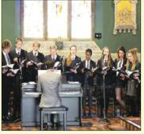
St Mary's chamber choir at the Good Shepherd Mass in Newcastle

In April, the Good Shepherd Mass took place at St Mary's Cathedral in Newcastle. This was a great celebration of the fundraising that had taken place for St Cuthbert's Care in the local primary and secondary schools this year. The mass – which took as its main