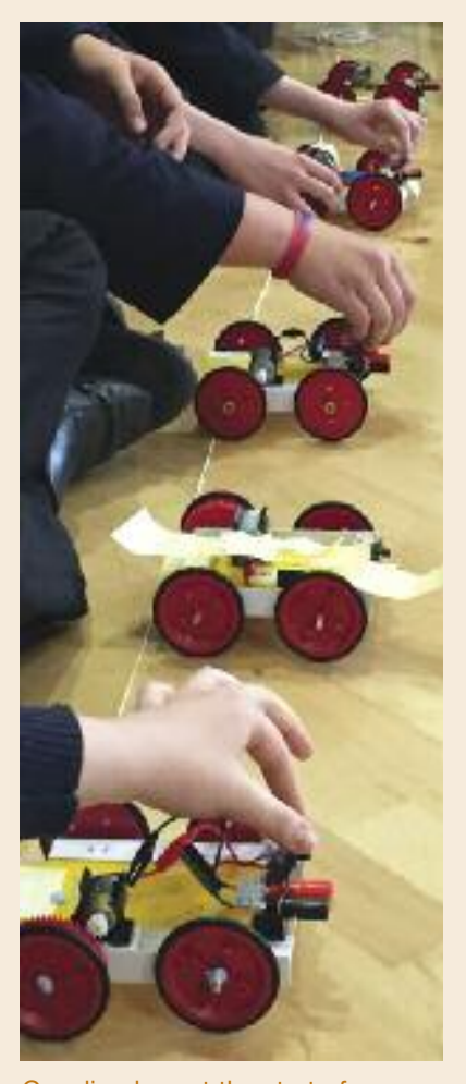
Cars lined-up at the start of a race