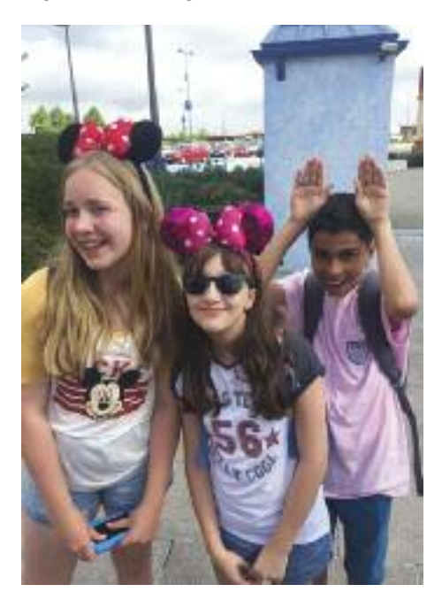
Three of the party enjoy themselves at Eurodisney

The next morning, after a few pains au chocolat and croissants for breakfast, the students were ready to go to Laval Market and impress the locals with their French. They took great delight in chatting with a local bee-keeper about his honey, ordering crêpes and macaroons, and picking up new vocabulary from the fruit and veg stalls. When it was time to go, it was clear from all the purchases that had been made that the students' confidence in speaking French had grown massively.