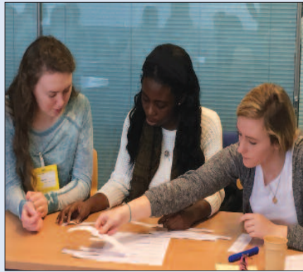
Three of the students attempt to balance the nation's books

After a tour of the facility and some lunch, the afternoon involved even more complex number-crunching.