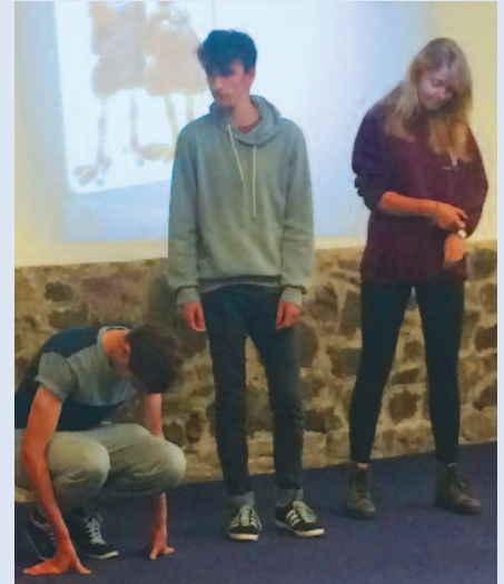
The retreat involved some role-play and drama