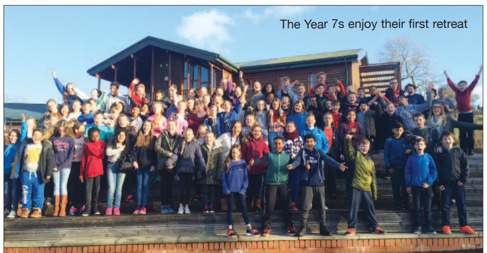
The Year 7s enjoy their first retreat