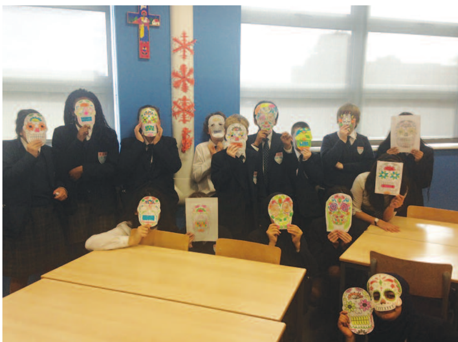
Members of the Language Club mark the Day of the Dead with some artwork