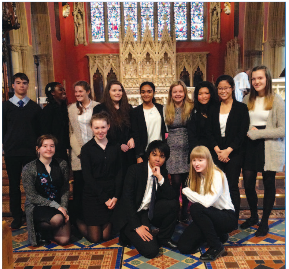
Thirteen of the school's participants in the Pope John Paul II Diocesan Award

Our school was also represented at St Mary's Cathedral by the sixty-strong choir which led the music. They sang