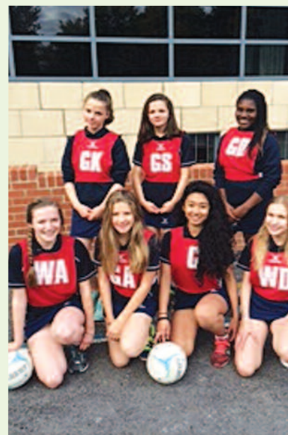
The Year 10 netball team

this, they enjoyed a tour of Newcastle University’s main campus and were tested on what they had learned with a fun quiz. Overall, the students enjoyed a very successful and informative day. They were definitely inspired to start thinking about what they want to do when they leave school.