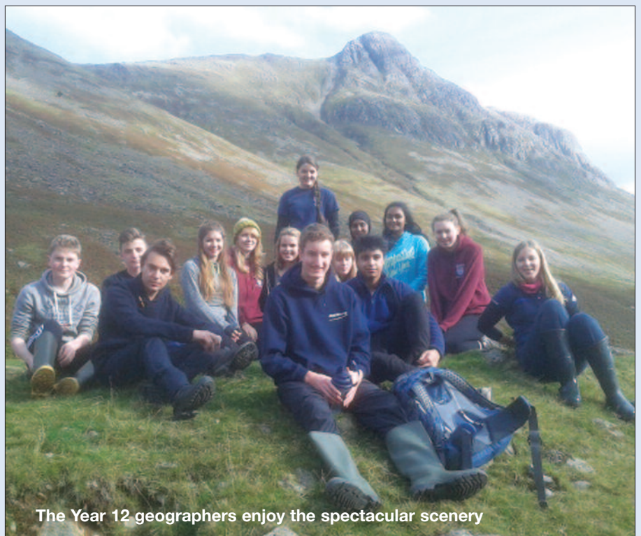
The Year 12 geographers enjoy the spectacular scenery