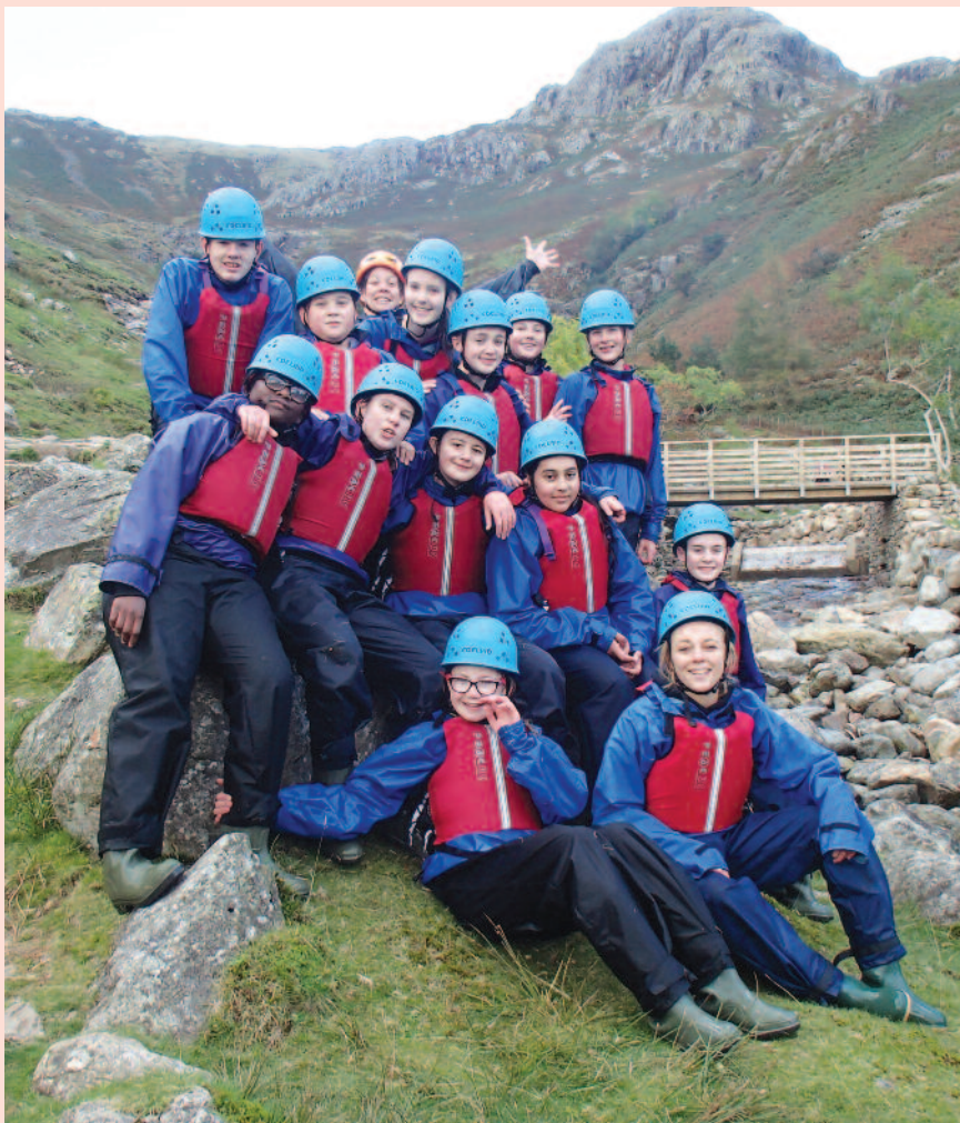
One group enjoys the scenery and the Thurston experience

Thurston Outdoor Activity Centre is located on the shores of Lake Coniston in the Lake District and is a superb location to participate in outdoor and adventure activities. St Mary's has a long and proud link with Thurston, and has been taking students to the centre for over fifteen years.