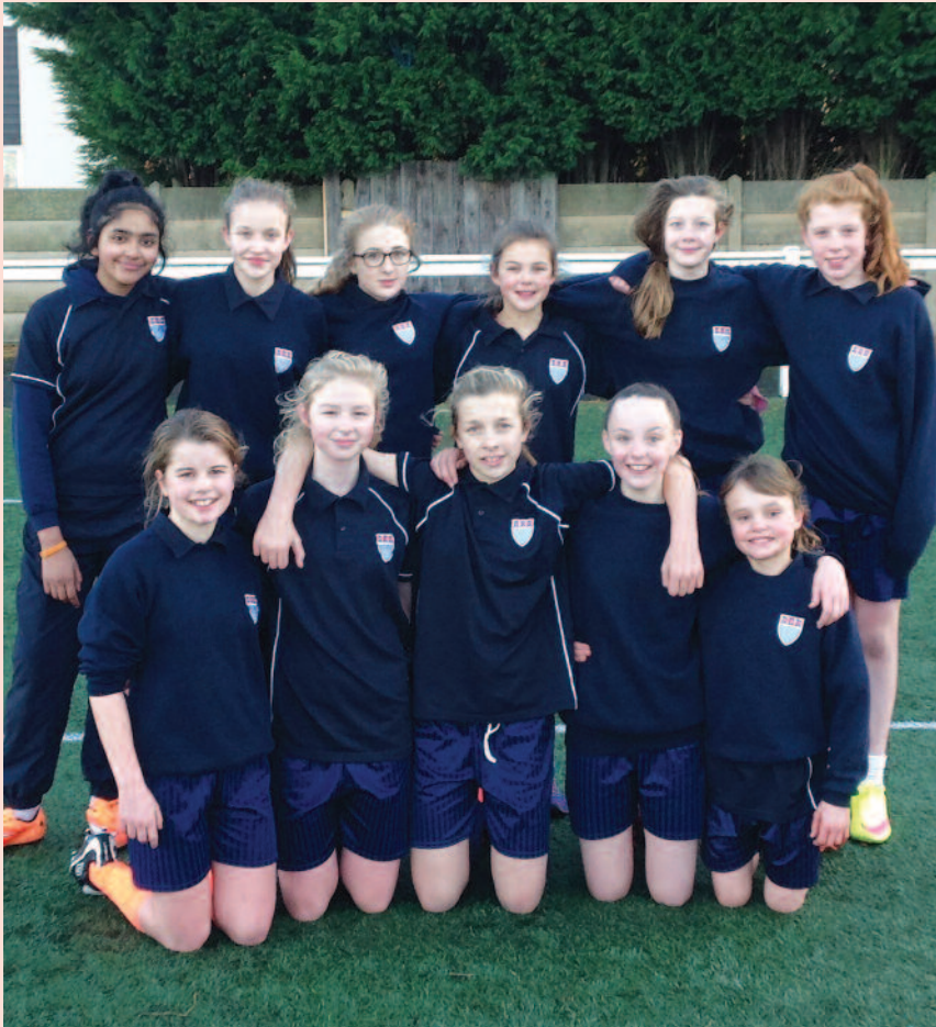
The Year 7 and 8 rugby squad