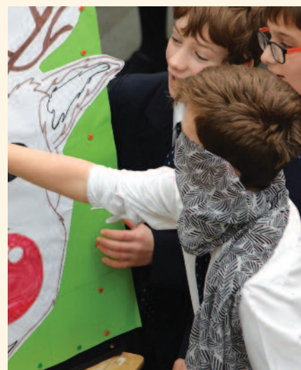
Festive fun at the Advent Fayre