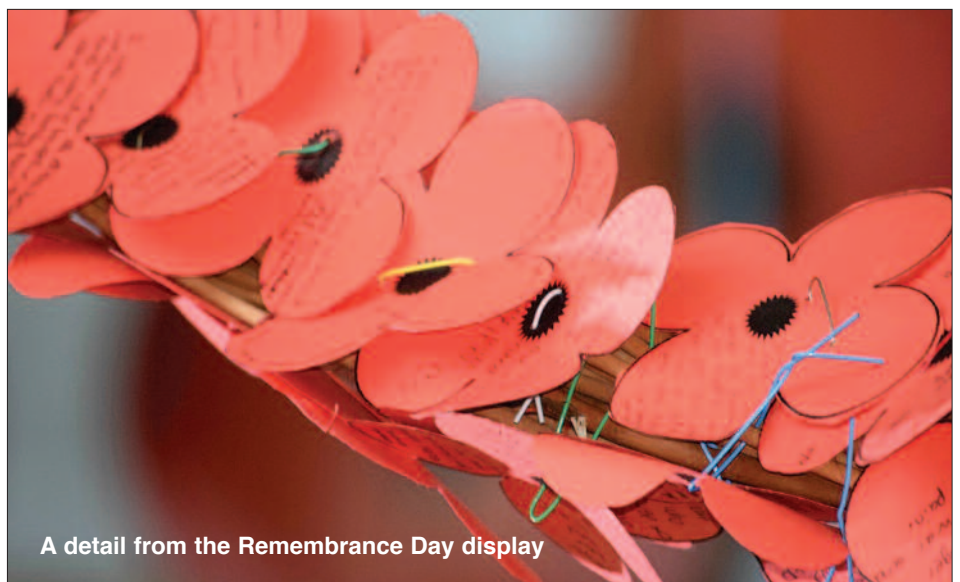
A detail from the Remembrance Day display