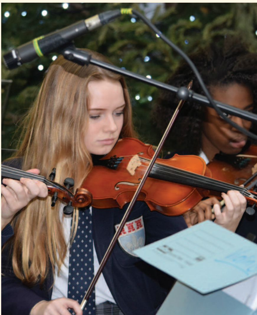
Rehearsing for the Christmas Concert