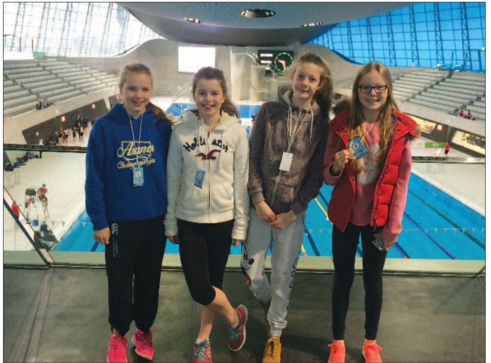
The girls at the London Aquatics Centre ahead of the competition