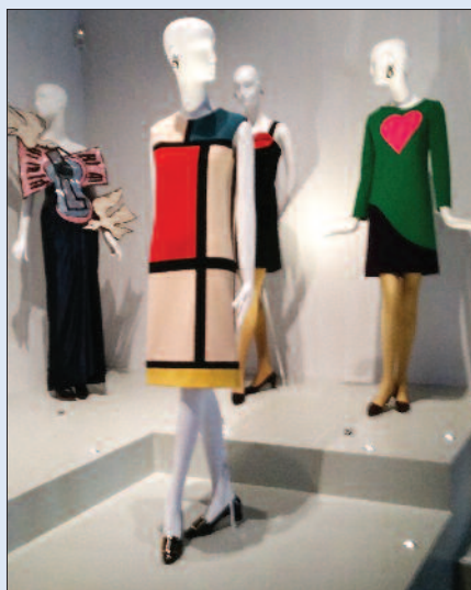
One of the displays featured in the Yves Saint Laurent exhibition

Year 12 and 13 A-level Fashion students were fortunate to be able to visit Bowes Museum this term to see