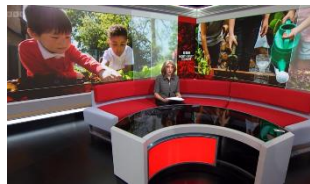
(the picture should take you to the clip on our Instagram)

Last term we welcomed in BBC North West Tonight who wanted to follow the story of our garden. This originally aired on 21 st May and the short clip can now be viewed on our Instagram page @crownstreetprimary