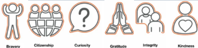
Bravery Citizenship Curiosity Gratitude Integrity Kindness