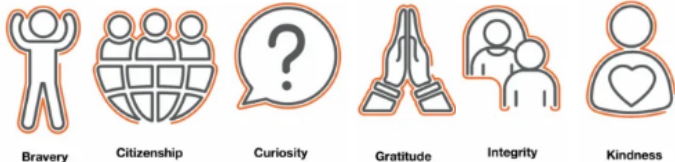
Bravery Citizenship Curiosity Gratitude Integrity Kindness