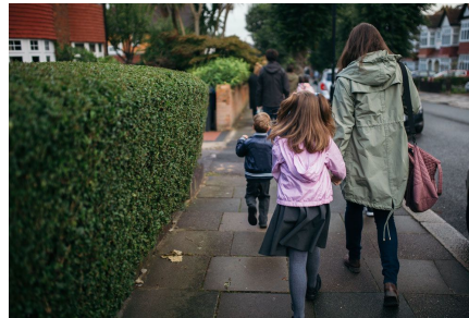
Walk the route to school