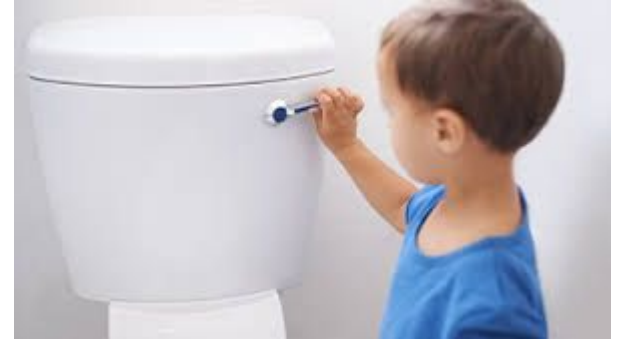
Using the toilet and hygiene