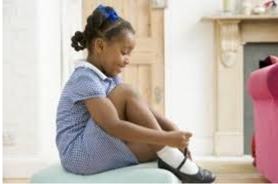
Basic dressing and putting on shoes