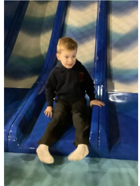
On Monday Rainbow class went to Kiki's Kabin for our end of year treat. We had a great time with our grown ups and friends. It was hard to get photos as we were running and jumping so much!