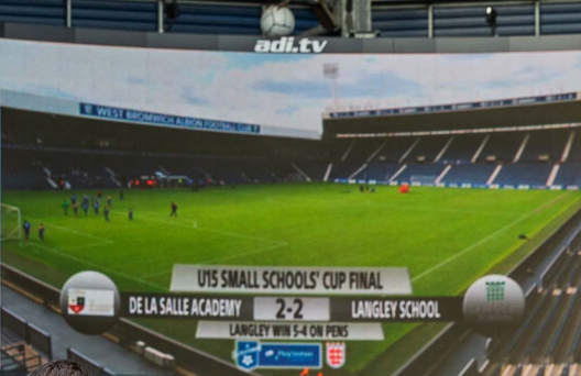
PlayStation Small Schools' Trophy