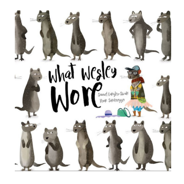
What Wesley Wore

Four inter-linked lively, short stories about two brothers in a British Asian family.