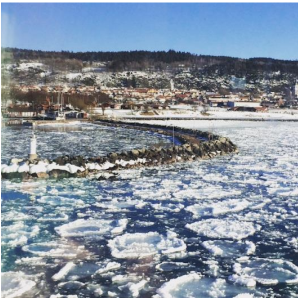
The town of Granna and a very icy lake!