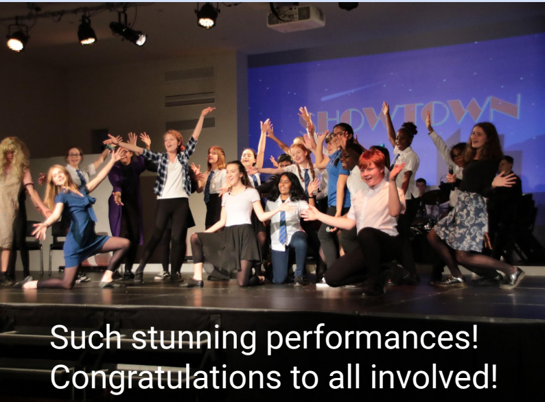
Such stunning performances! Congratulations to all involved!