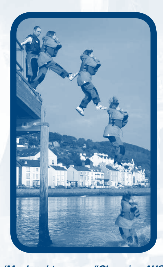
'My daughter says: "Choosing AHS was the best thing I ever did".' Ofsted

If you are interested in entry to the Sixth Form, you are invited to look on the website to download our Sixth Form Prospectus (from early November onwards), which gives full details on how to apply, and to attend our Sixth Form Information Evening in November.