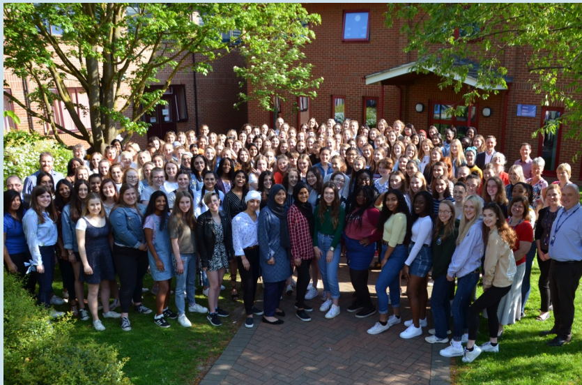
Year 13 about to go on study leave