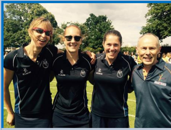
The winning staff relay team!