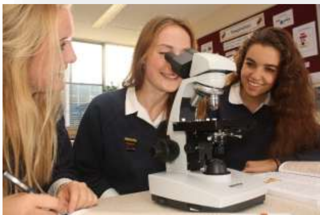
Microscopes in Science