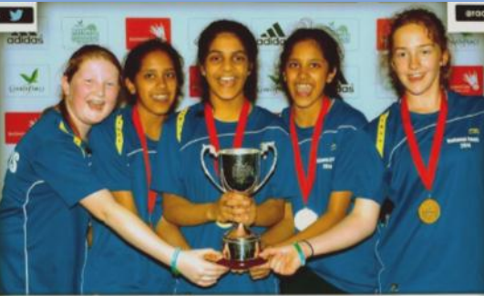
Aylesbury High School National Schools Badminton Championships 2014