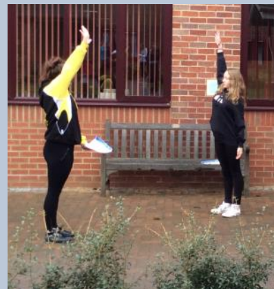
Learning our Water Polo officiators' signals