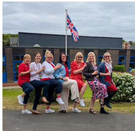
08.05.25 - 80th Anniversary of VE Day