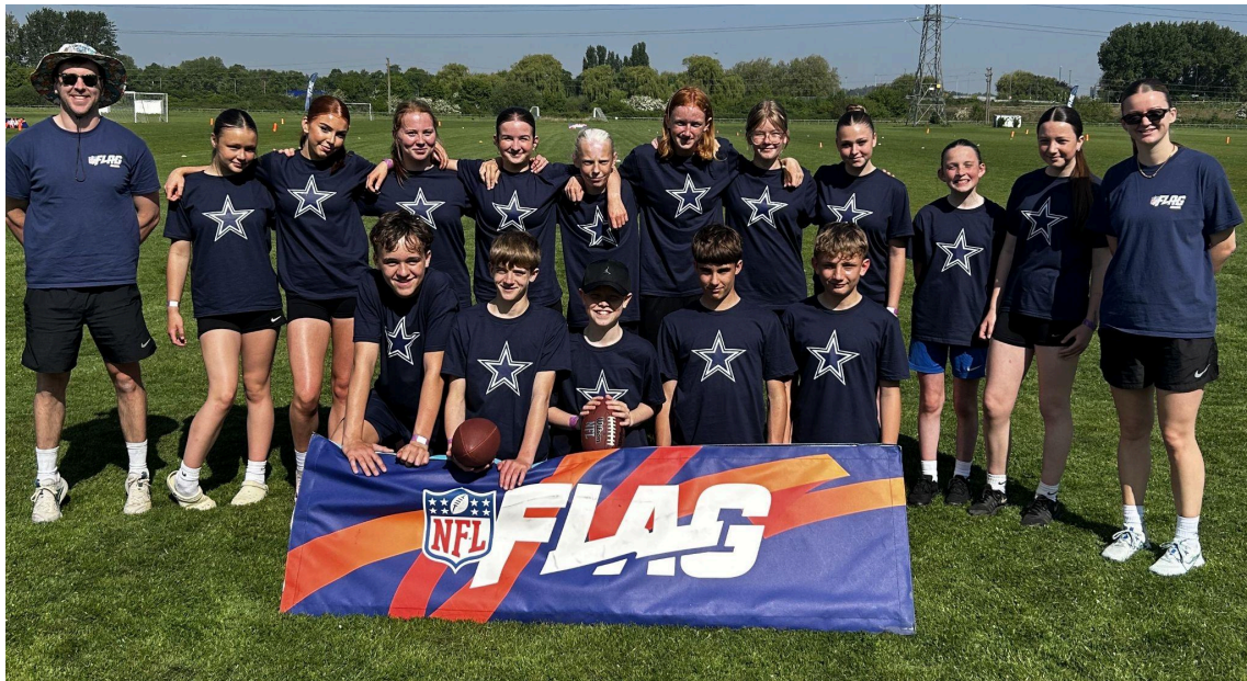
Yrs 8, 9 * 10 NFL Regional Tournament in Nottingham - 01.05.25