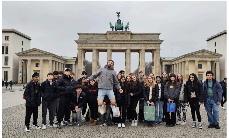
Year 10 Berlin Residential Trip