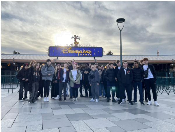
Media Disney Land Paris Residential Trip