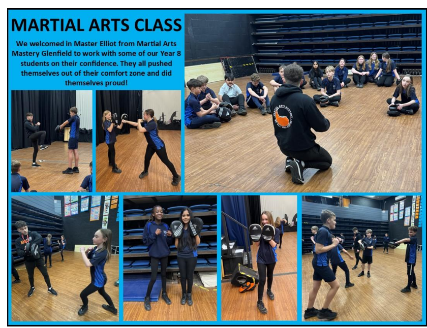
Year 8 Martial Arts Master Class 13.1.25