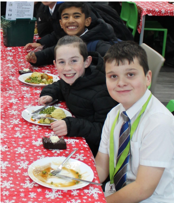
Christmas Dinner Week!