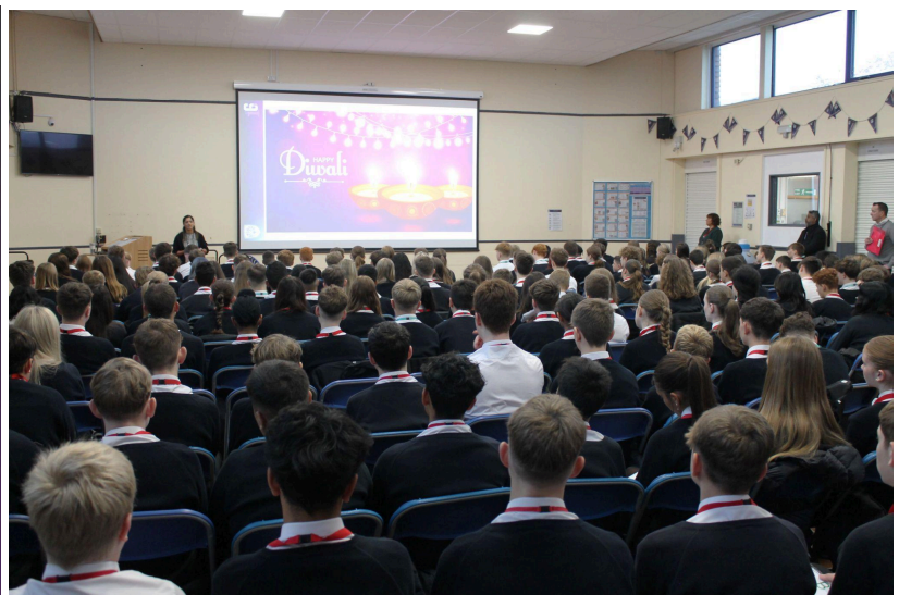
Diwali assemblies all week