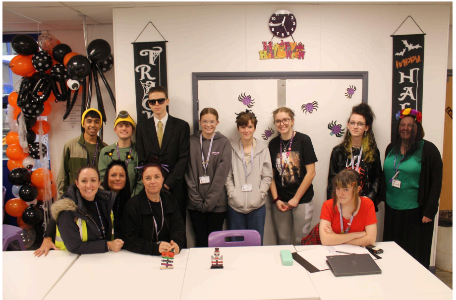
🎃🎃🎃 Halloween at BGLC 🎃🎃🎃