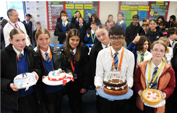
European BAKE OFF 25.9.24