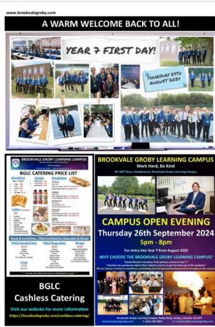
Campus September NEWSLETTER