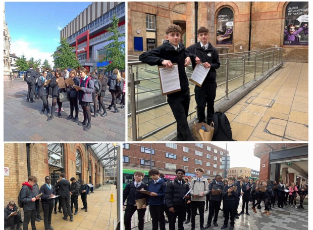
Yr 11 Geography Fieldtrip 24 & 25.9.24