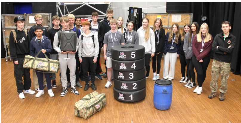
Year 12 Army Team Building Day 10.9.24