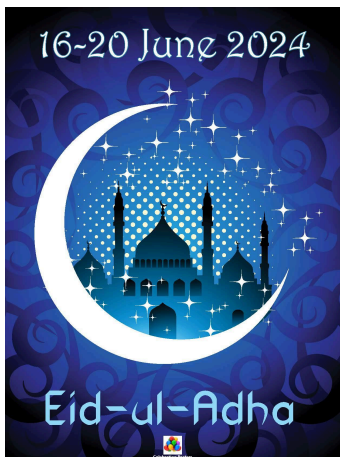
Eid-ul-Adha 16 - 20.6.24