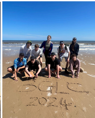
Yr 12 Geography Field Trip to Norfolk