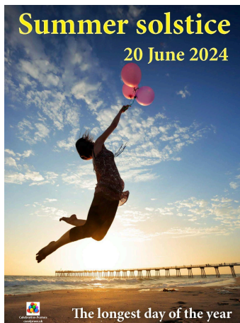
Summer Solstice 20.6.24