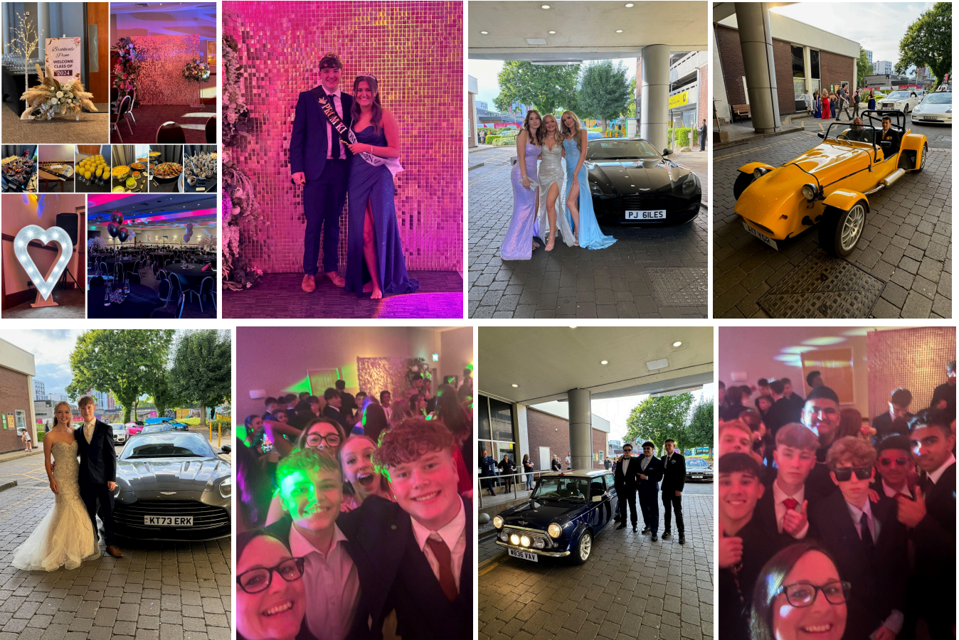
YEAR 11 PROM 19.6.24