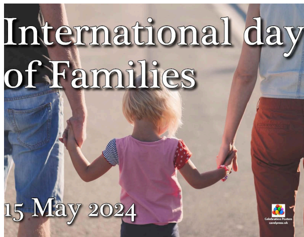
International Day of Families 15.5.24