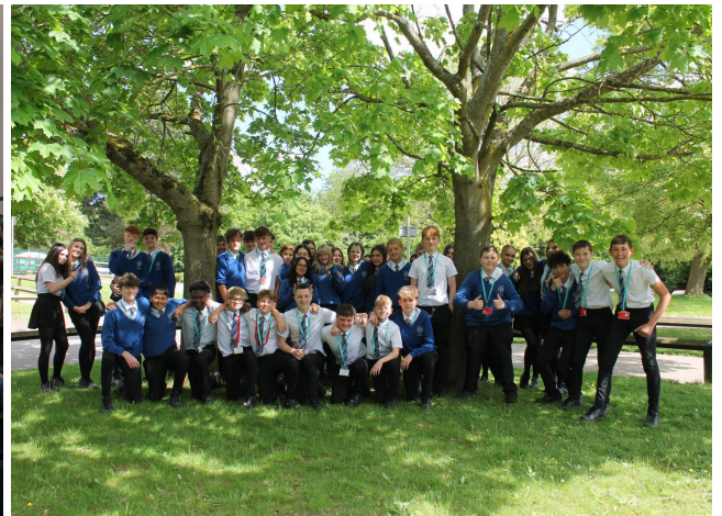
Year 9 MVP Training 13.4.24