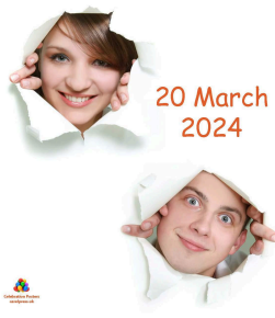
Int'l Day of Happiness