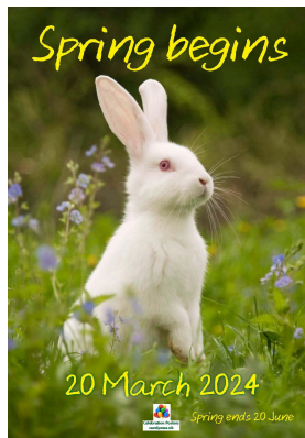
Spring begins 20.3.24